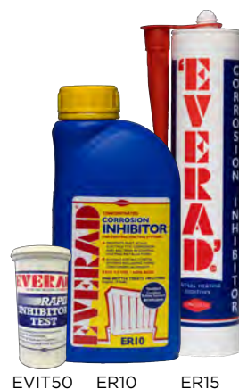
EVIT50 ER10 ER15