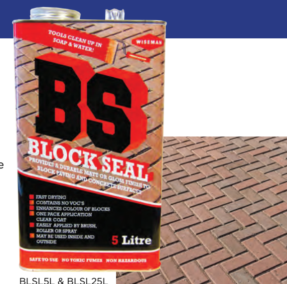
BLSL5L &amp; BLSL25L