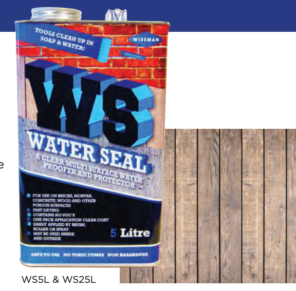
WSL5L &amp; WSL25L