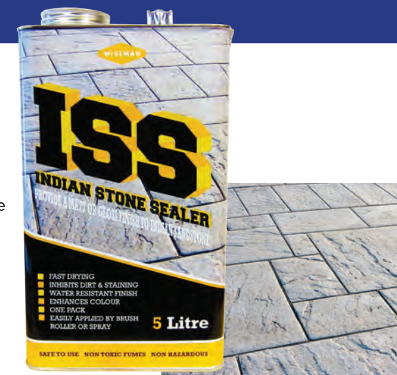
ISS5L &amp; ISS25L